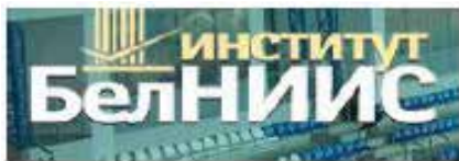
BELNIIS - Belarus

Our technical and engineering team is supported and advised by European institutes. For more information about products please contact PEŠTAN technical support or regional salesman.