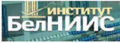
BELNIIS - Belarus

Our technical and engineering team is supported and advised by European institutes. For more information about products please contact PEŠTAN technical support or regional salesman.