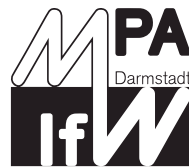
MPA - Germany