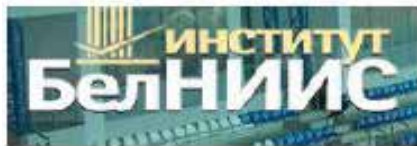
BELNIIS - Belarus

Our technical and engineering team is supported and advised by European institutes. For more information about products please contact PEŠTAN technical support or regional salesman.